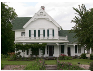
Zimmerman House Today

The Hardy Plant Society of Oregon Elaine Jones Memorial Grant Program has awarded the Zimmerman Heritage Farm a $400 grant! We had requested $930 to prune the pear, cherry and magnolia trees south of the house, and to provide mulch and new garden tools. We'll combine this grant award with the $422.75 proceeds from the May Plant Sale and see how much of this project we can complete this year. We are very grateful to the Hardy Plant Society for their support!